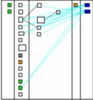
Figure 1. Class blueprint embedded in the Squeak IDE.

ties into IDE is still in its infancy, we thus also give insights in planned future work towards a more complete integration of software analyses in IDEs in Section 3.