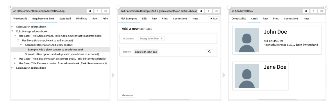
Fig. 1: Moldable requirements approach

nology, which facilitates communication between team members [17]. However, such approaches have received limited appreciation in practice due to extensive required training and laborious efforts for specifying detailed models [18].