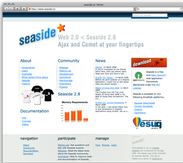
Figure 2: The web site of Seaside. It is built on top of Pier and features interactive Seaside example applications. The news feed is automatically built from community blogs.

and reports, to validate data, to process queries, to implement object persistency, and to initialize objects.